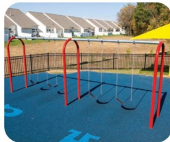
2 Bay 8ft Arch Swing