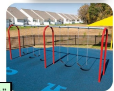
Bay 8ft Arch Swing

"And the streets of the city shall be full of boys and girls playing in its streets." Zechariah 8:5