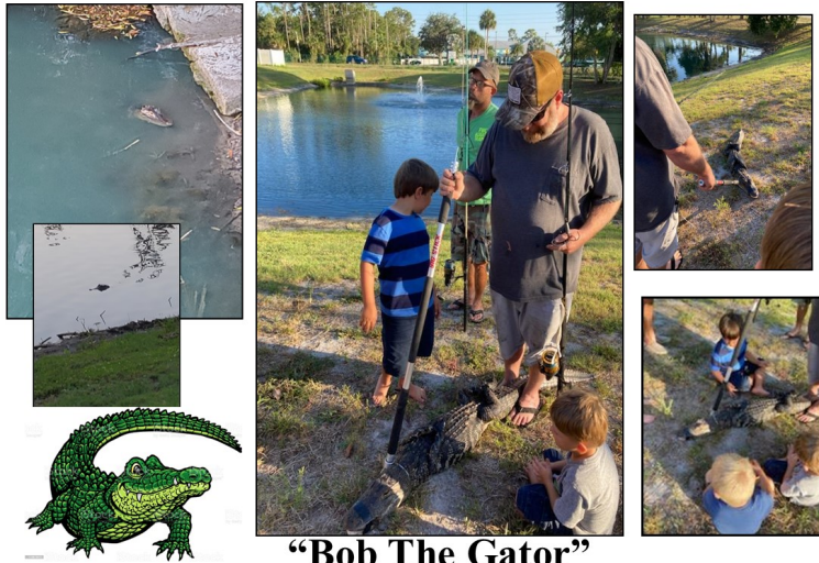
“Bob The Gator”

If you feel led to donate to help us cover this expense, please mail in a check and write “security fence” in the memo section, or go to our website and donate now with your credit card or PayPal and write “security fence” in the memo section.